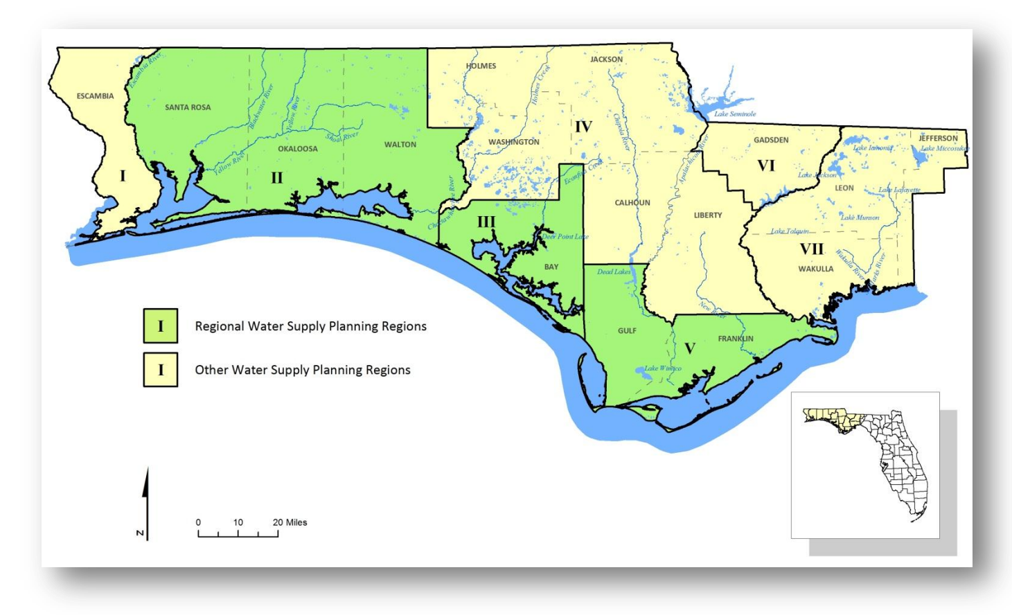
Figure 1. Water Supply Planning Regions

As required by Section 373.709(2)(a)1, F.S., the level of certainty planning goal for identifying water supply needs of existing and future reasonable-beneficial uses in the RWSPs was based on meeting such needs for a 1-in-10 year drought event. Water demand can be expected to increase during drought conditions for certain water uses, such as agricultural irrigation and outdoor water use. A more thorough discussion of the quantification of these demands may be found in the 2008 Water Supply Assessment Update (NWFWMD 2008a). A focus of many of the District's water resource development (WRD) activities is to help drought-proof northwest Florida communities through development and interconnection of alternative water supplies.