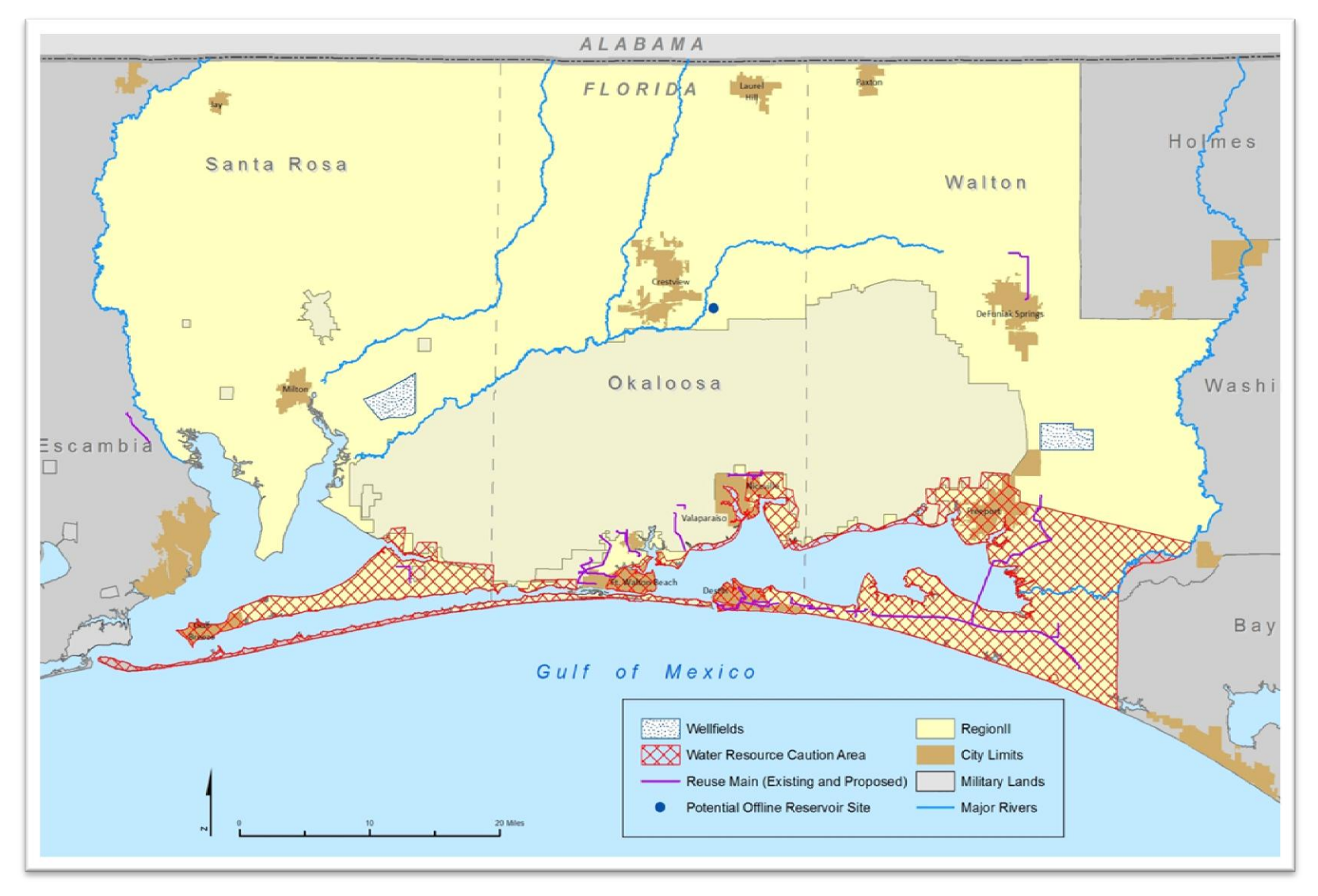
Figure 2. Water Supply Planning Region II