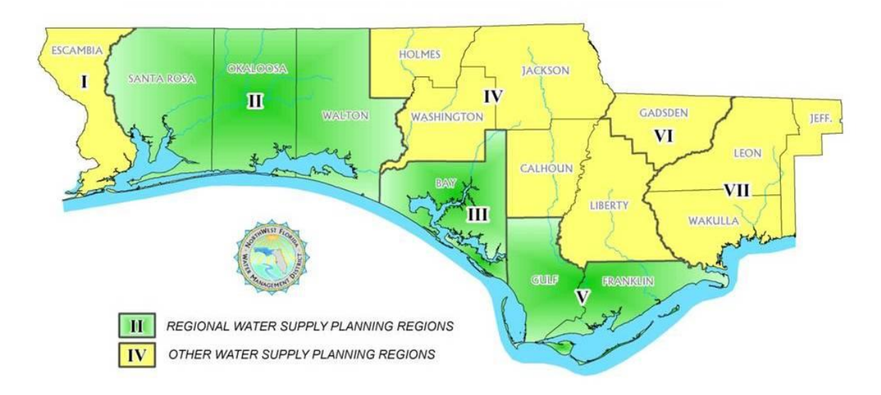
Figure 1. Water Supply Planning Regions

As required by Section 373.0361(2)(a)1, F.S., the level of certainty planning goal for identifying water supply needs of existing and future reasonable-beneficial uses in the RWSPs was based on meeting such needs for a 1-in-10 year drought event. Water demand can be expected to increase during drought conditions for certain water uses, such as agricultural irrigation and outdoor water use. A more thorough discussion of the quantification of these demands may be found in the 2008 Water Supply Assessment Update (NWFWMD 2008a). A focus of many of the District's water resource development (WRD) activities is to help drought-proof northwest Florida communities through development and interconnection of alternative water supplies.