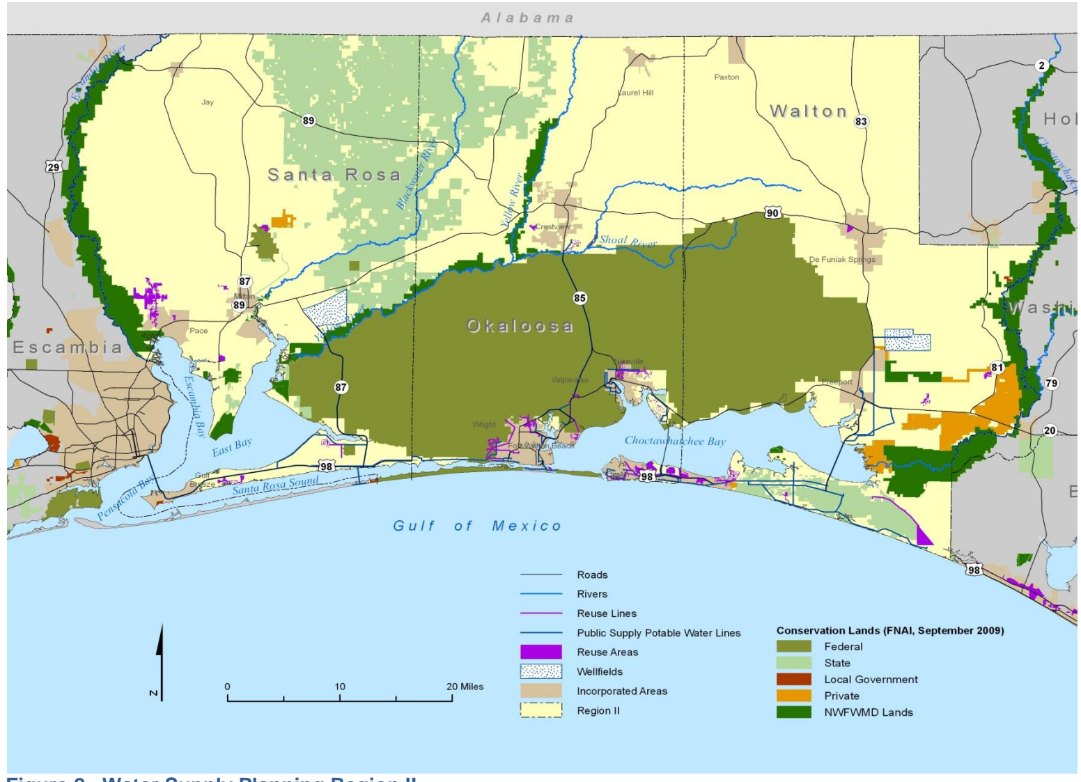
Figure 2. Water Supply Planning Region II