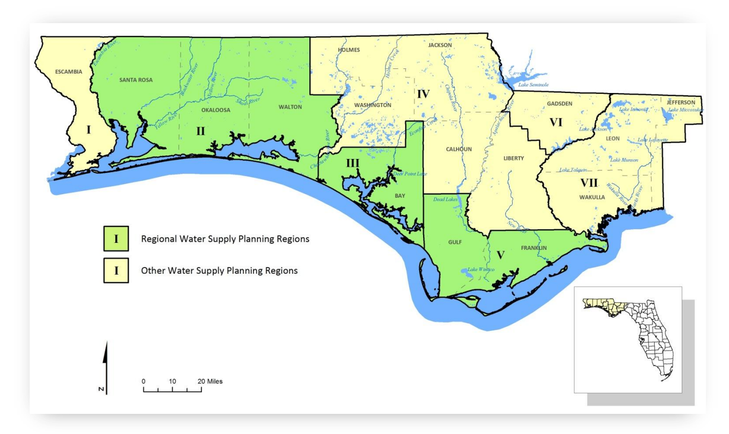
Figure 1. Water Supply Planning Regions

As required by Section 373.709(2)(a)1, F.S., the level of certainty planning goal for identifying water supply needs of existing and future reasonable-beneficial uses in the RWSPs was based on meeting such needs for a 1-in-10 year drought event. Water demand can be expected to increase during drought conditions for certain water uses, such as agricultural irrigation and outdoor water use. A more thorough discussion of the quantification of these demands may be found in the 2008 Water Supply Assessment Update (NWFWMD 2008a). A focus of many of the District's water resource development (WRD) activities is to help drought-proof northwest Florida communities through development and interconnection of alternative water supplies.