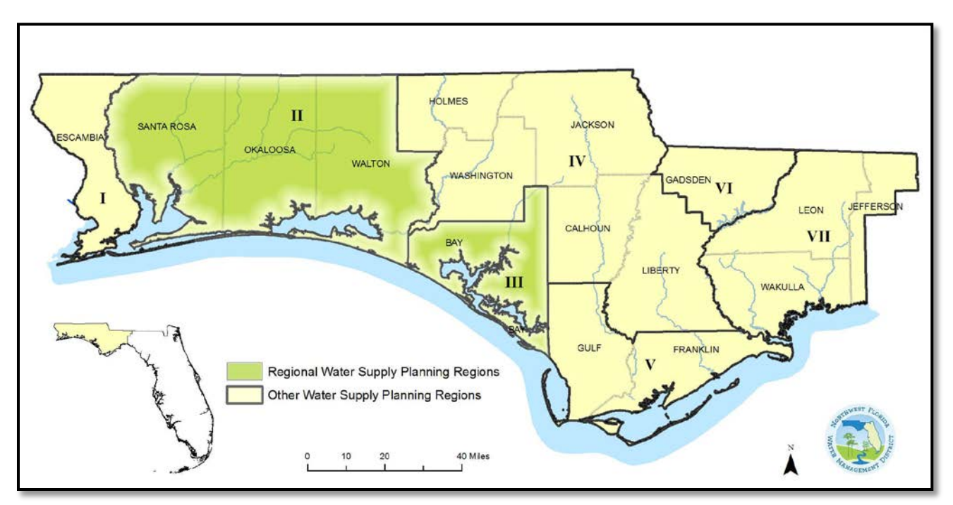
Figure 1. Water Supply Planning Regions

Region V communities to address resource needs and concerns and is continuing hydrologic data collection and analysis to support resource monitoring.