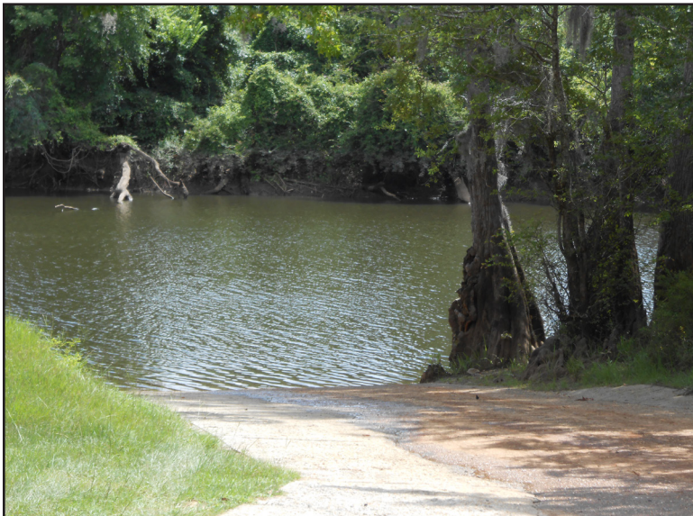
Above: Cotton Lake Boat Ramp Top right: Cotton Lake Campsite Center: Cotton Lake Campsites Bottom right: Cotton Lake Campsite Diagram